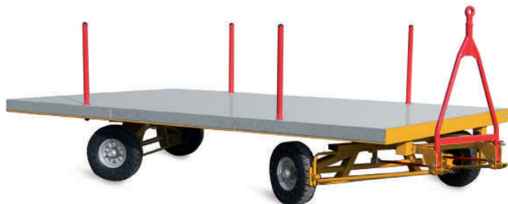
MOD. 43-VRSE - Steering system on big steel ball-bearing fifth wheel