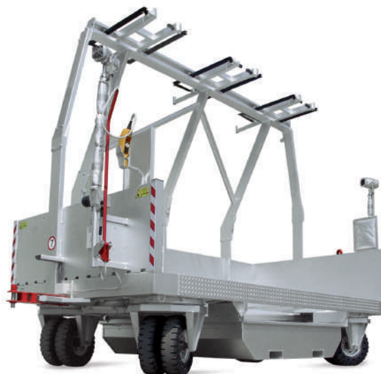
MOD. 243-RVSE - Steering system on big steel ball-bearing fifth wheel