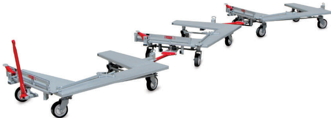
MOD. 10-114 - Steering system on swivelling forks